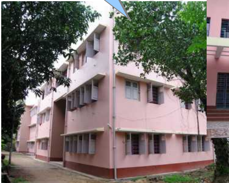
VIEW FROM CORNER