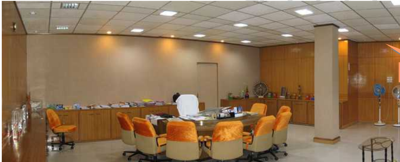
INSIDE THE CHAMBER