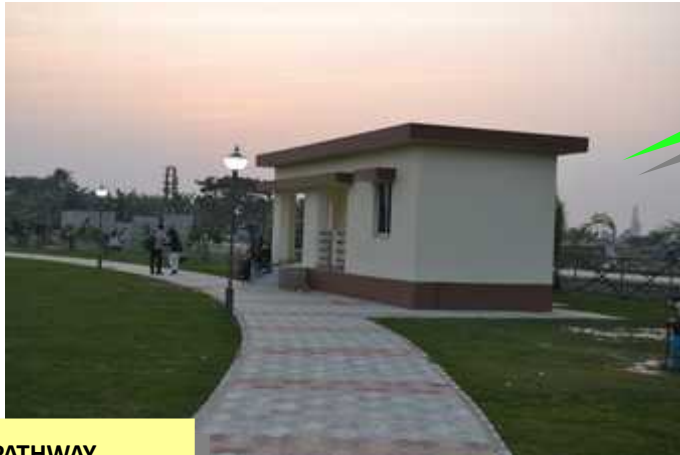
GOLF FAMILIARISATION CENTRE